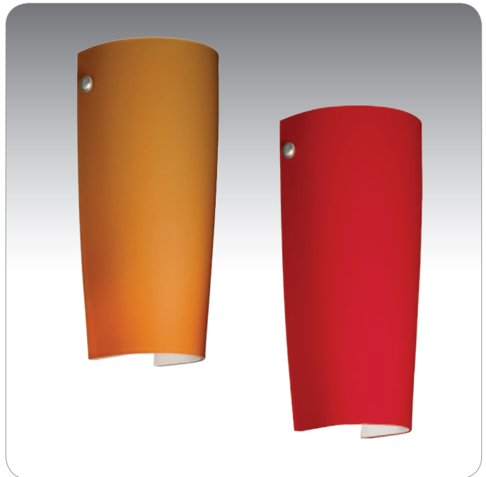
TOMAS SHOWN IN AMBER MATTE (704180) & RUBY MATTE (7041RM)

UL or ETL Listed. Suitable for Damp Locations (interior use only).