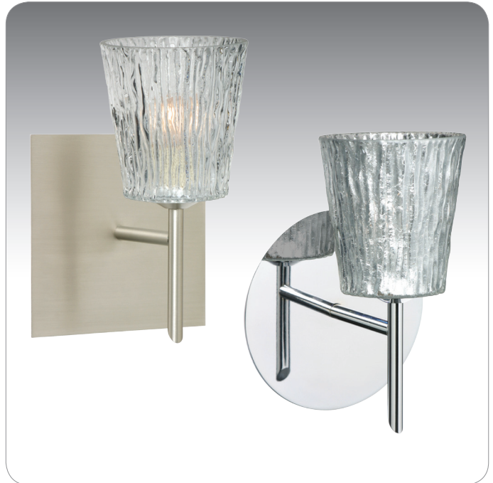
NICO 4 SHOWN IN CLEAR STONE (512500) WITH SQUARE CANOPY & STONE SILVER FOIL (5125SF) IN CHROME FINISH

UL or ETL Listed. Suitable for Damp Locations (interior use only).