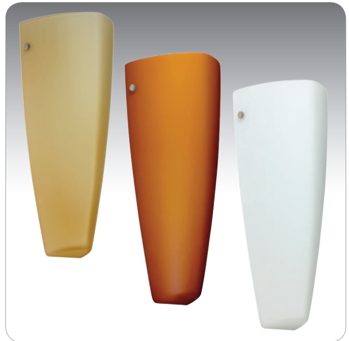
LINA SHOWN IN VANILLA MATTE (7083VM), AMBER MATTE (708380) & OPAL MATTE (708307)