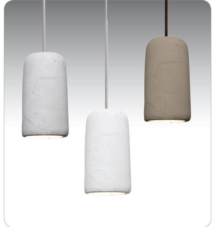
NATURAL (GLIDENA), WHITE (GLIDEWH) & TAN (GLIDETN) WITH BRONZE FINISH

UL or ETL Listed. Suitable for Damp Locations (interior use only).