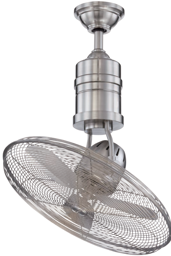
Stainless Steel Bellows III | Model . . . . BW321SS3