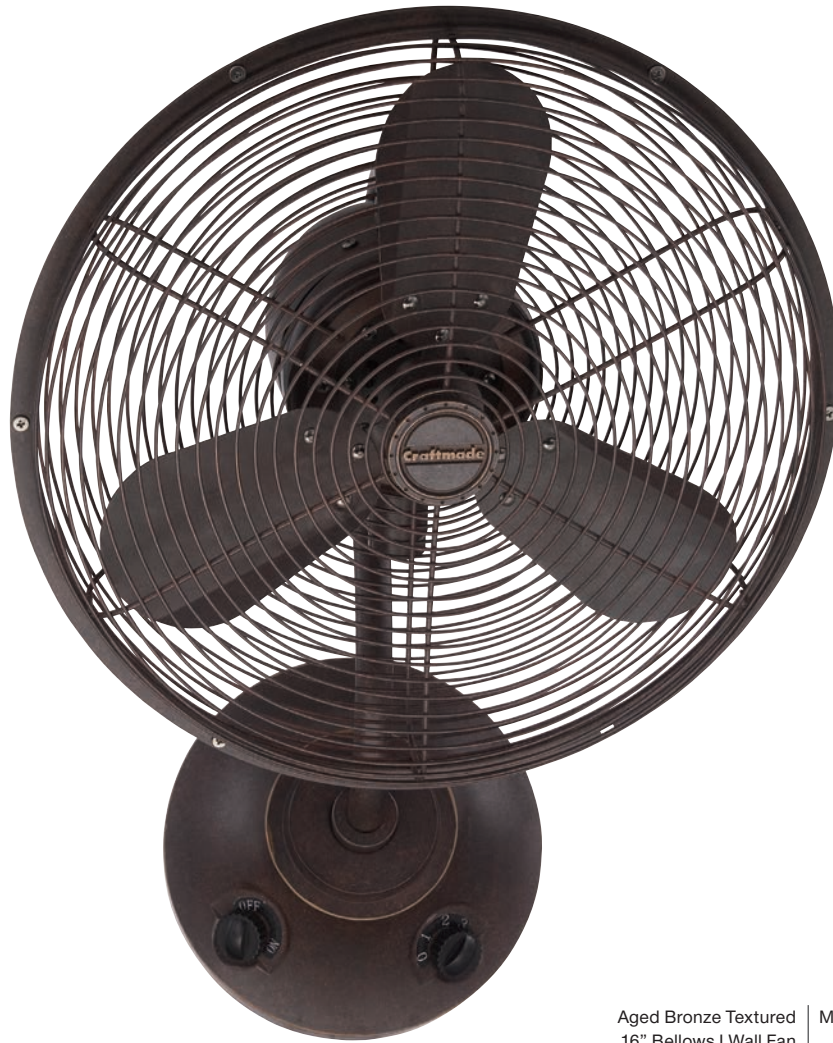
Aged Bronze Textured | Model . . . BW116AG3 16" Bellows I Wall Fan